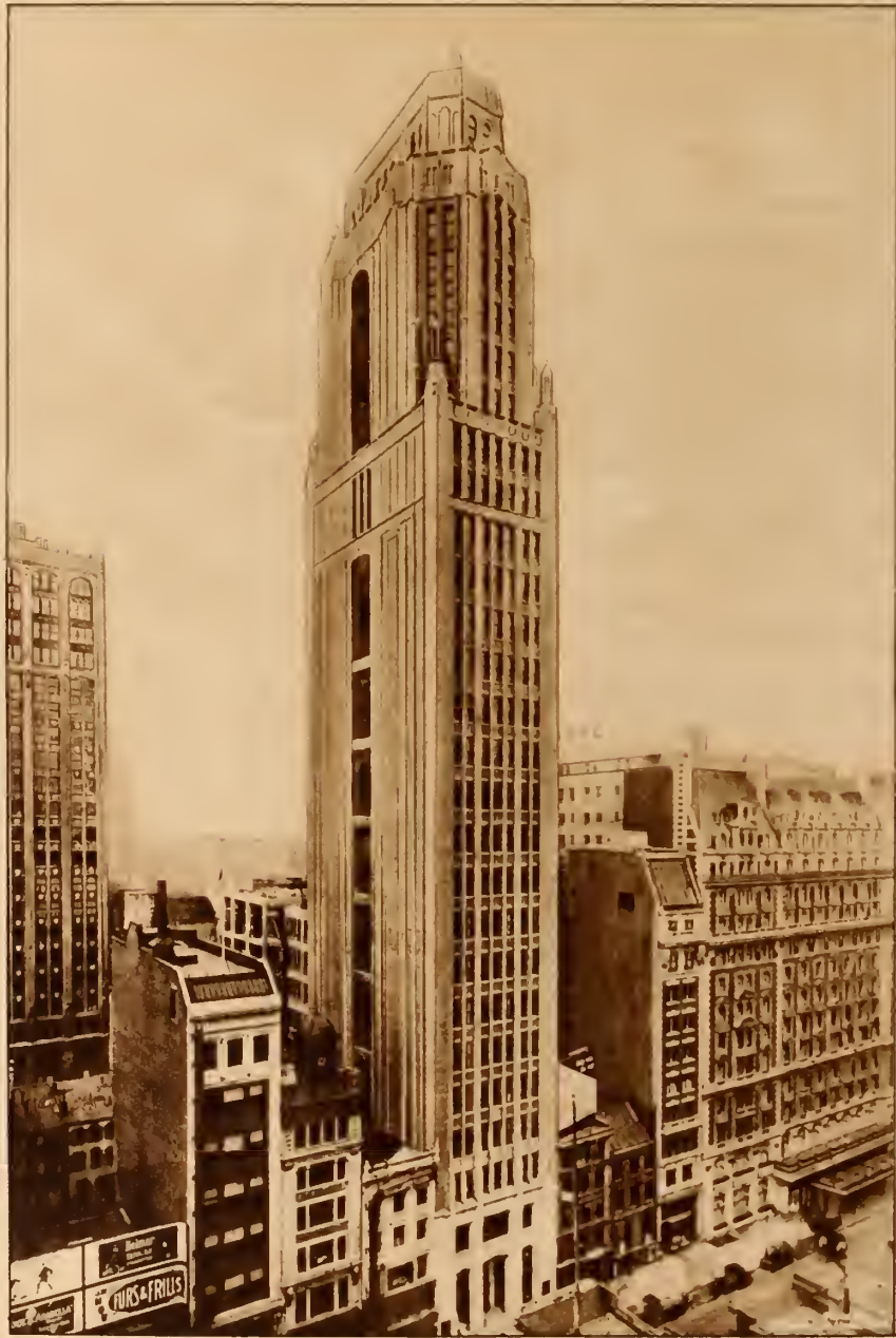
BUSH TERMINAL BUILDING, at 42nd Street near Broadway. This skyscraper deserves the name of "The Market Place of the World." It contains hundreds of sample rooms.